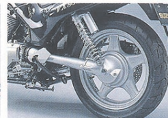
Shaft drive system